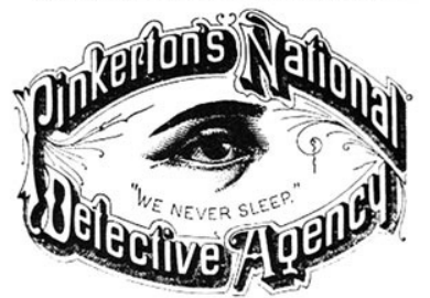
CONTACT YOUR LOCAL BRANCH FOR DETAILS